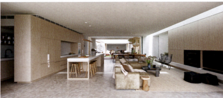
CHASE PROJECTS PTY LTD