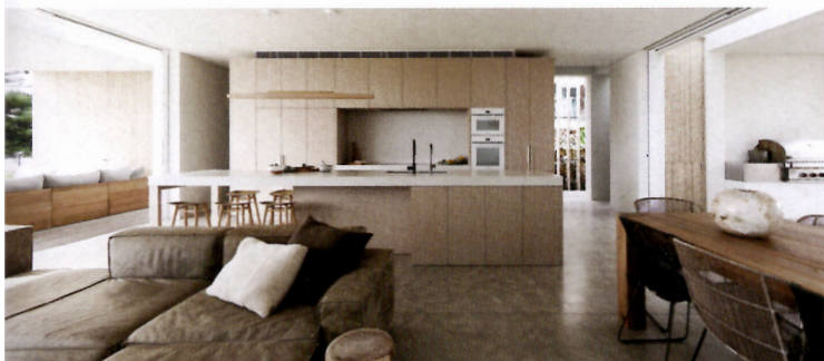
CHASE PROJECTS PTY LTD