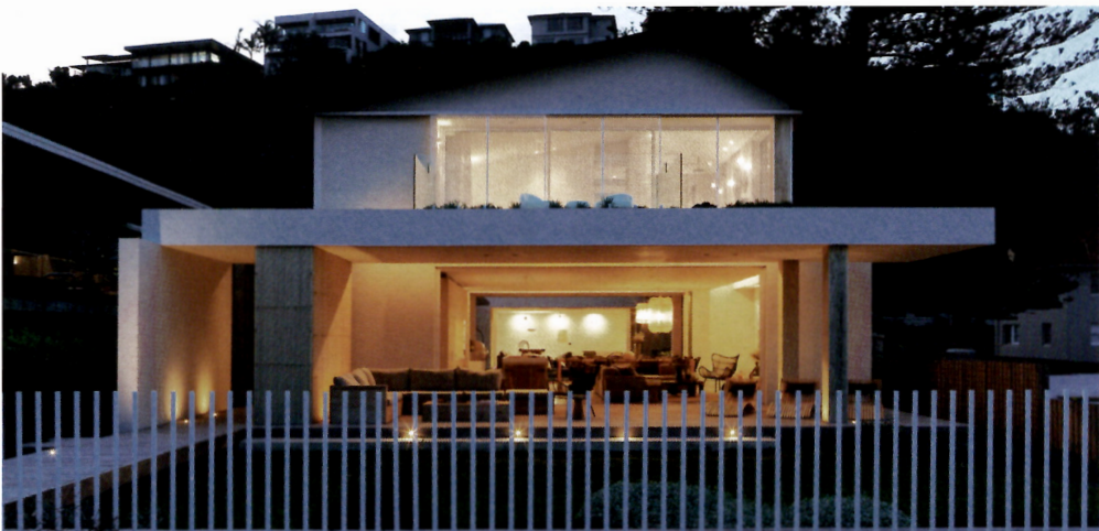
CHASE PROJECTS PTY LTD